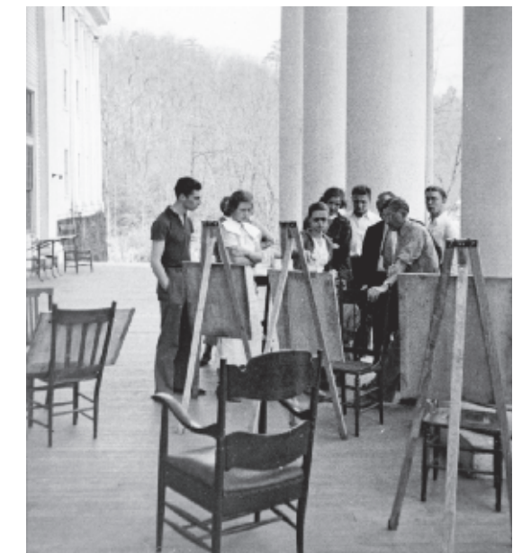
ABOVE: Black Mountain College: Josef Albers Zeichenkurs auf der Veran-da der Lee Hall, Blue Ridge Campus Frühling, 1936.

— Black Mountain: An Interdisciplinary Experiment 1933–1957 runs at the Hamburger Bahnhof, Museum für Gegenwart – Berlin through September 27, 2015.