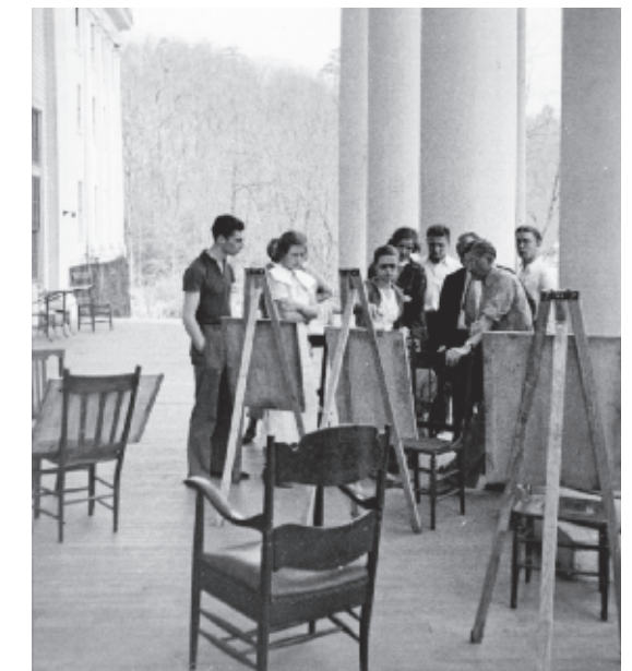
ABOVE: Black Mountain College: Josef Albers Zeichenkurs auf der Veran-da der Lee Hall, Blue Ridge Campus Frühling, 1936.

— Black Mountain: An Interdisciplinary Experiment 1933–1957 runs at the Hamburger Bahnhof, Museum für Gegenwart – Berlin through September 27, 2015.